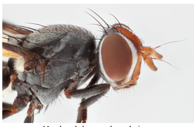
Head and thorax - lateral view