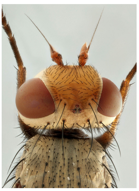
Head and thorax - dorsal view