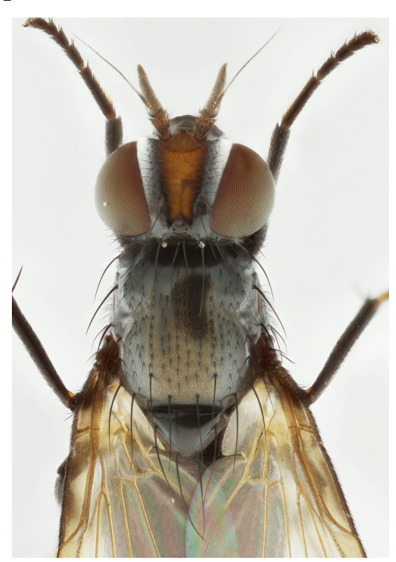
Head and thorax - dorsal view