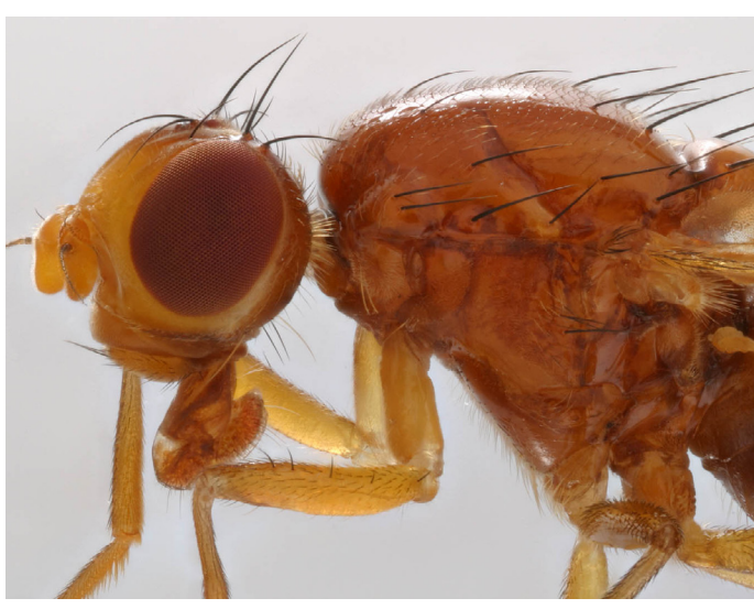
Head and thorax - lateral view