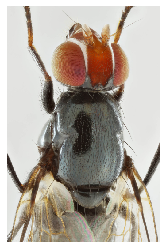
Head and thorax - dorsal view