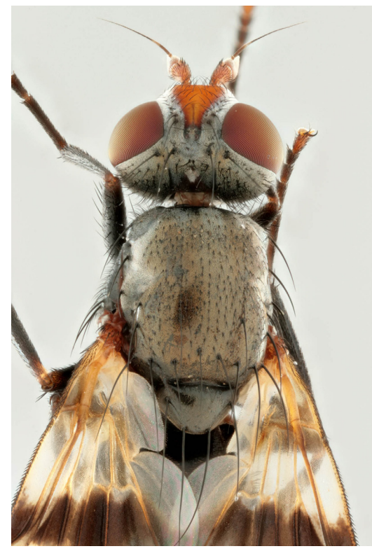
Head and thorax - dorsal view