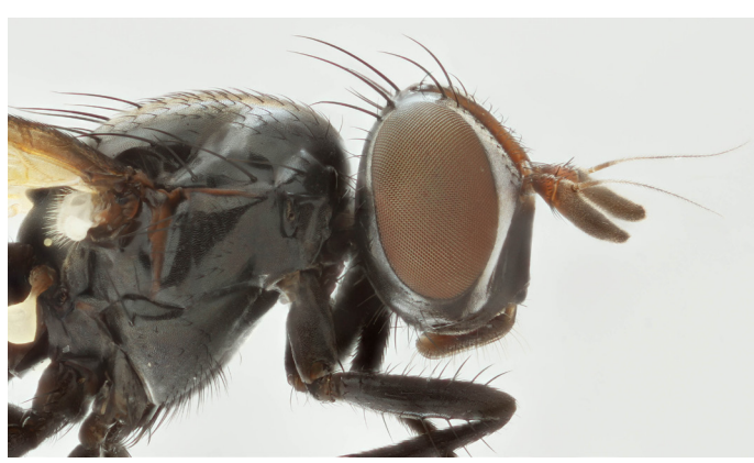
Head and thorax - lateral view