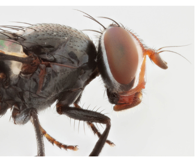
Head and thorax - lateral view