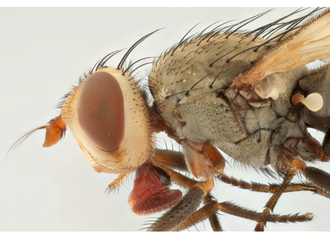
Head and thorax - lateral view