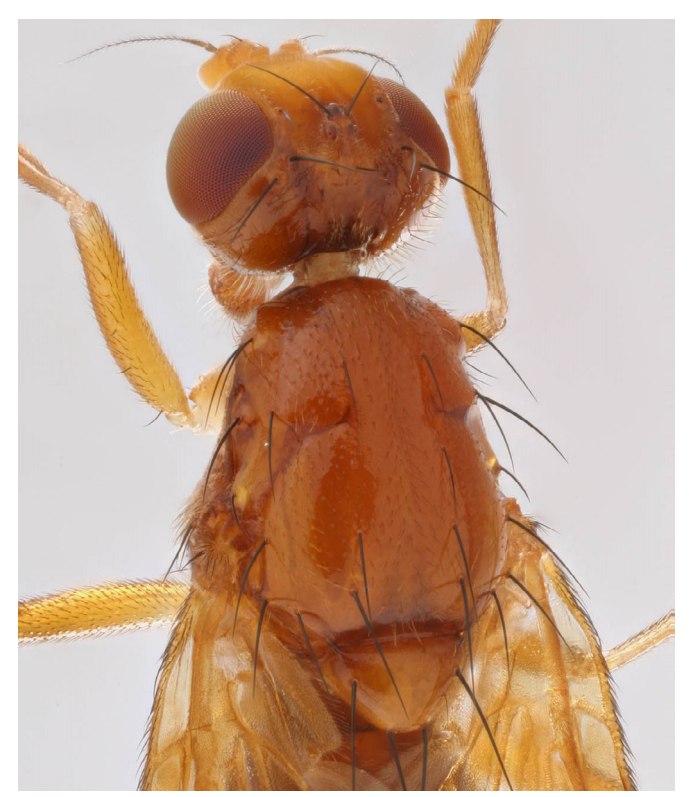
Head and thorax - dorsal view