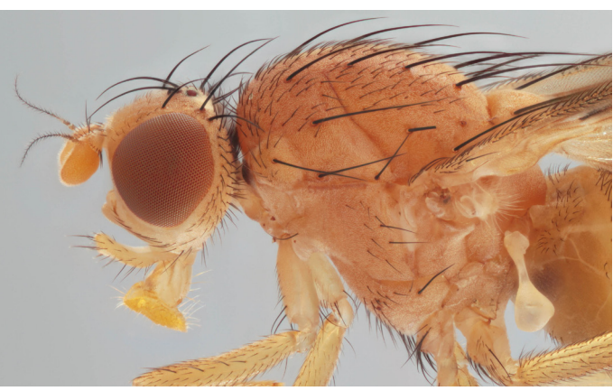
Head and thorax - lateral view