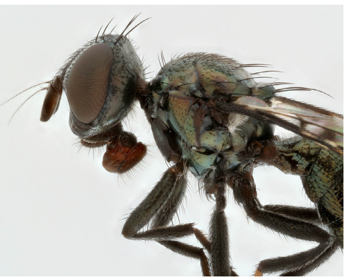
Head and thorax - lateral view