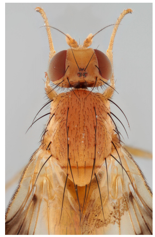
Head and thorax - dorsal view