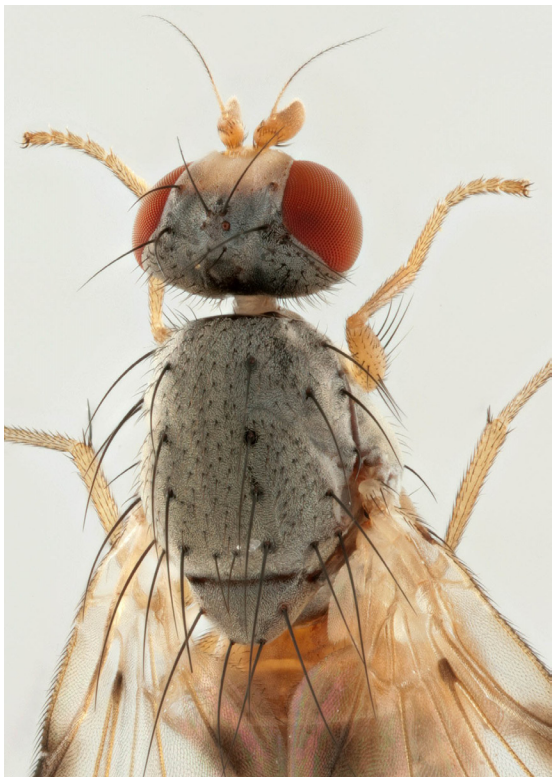
Head and thorax - dorsal view