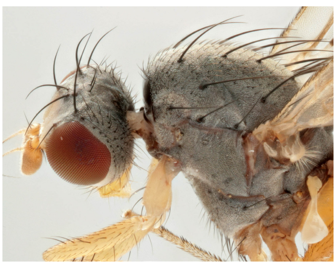
Head and thorax - lateral view