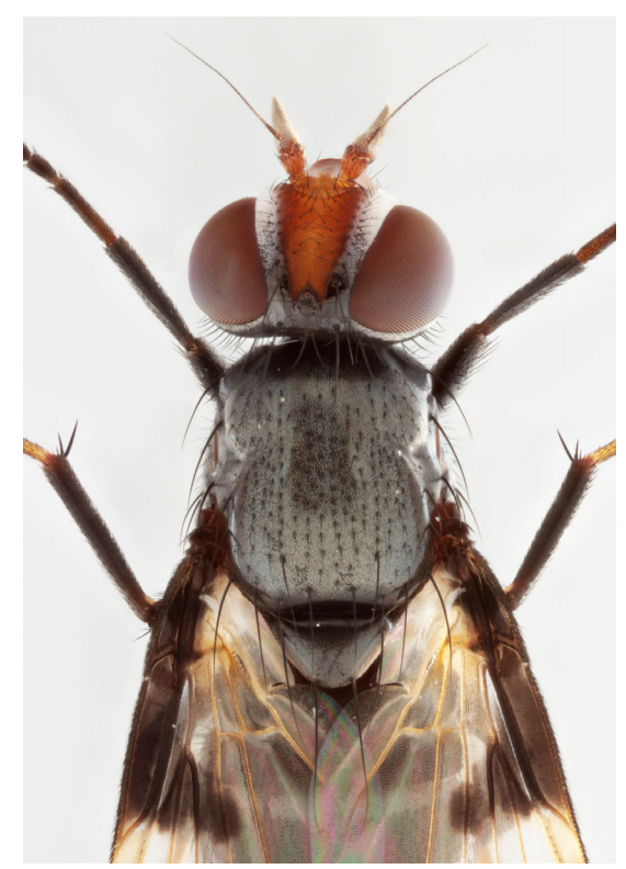
Head and thorax - dorsal view