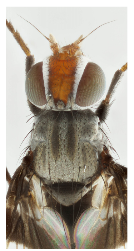
Head and thorax - dorsal view