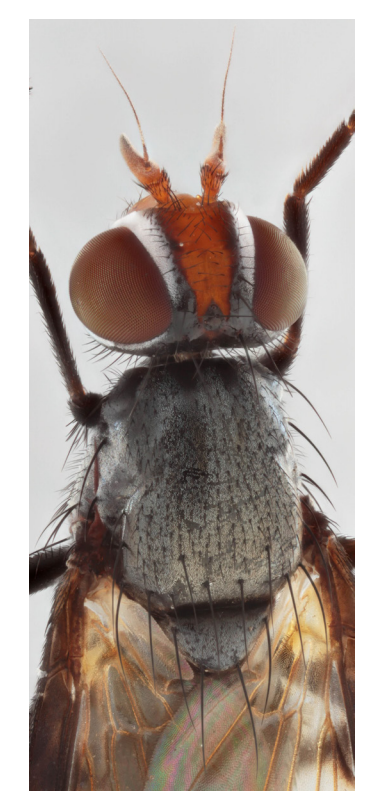
Head and thorax - dorsal view