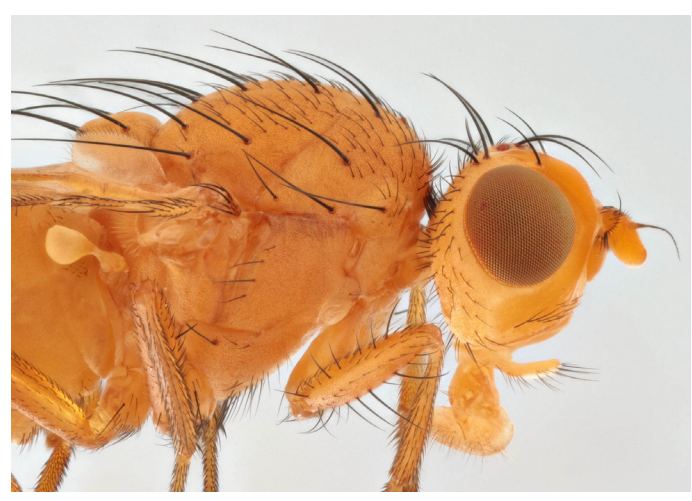
Head and thorax - lateral view