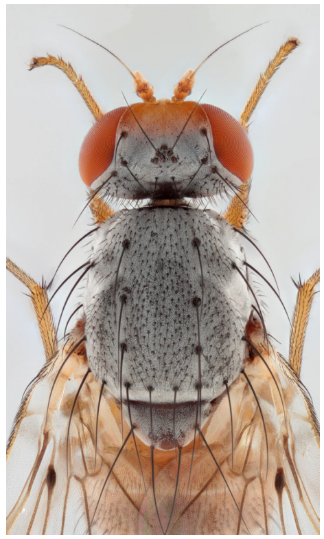
Head and thorax - dorsal view