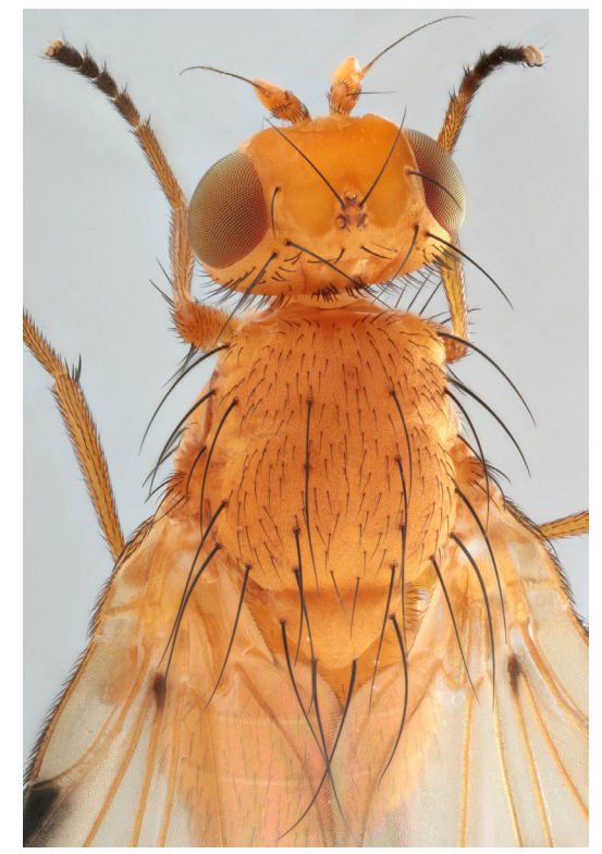
Head and thorax - dorsal view