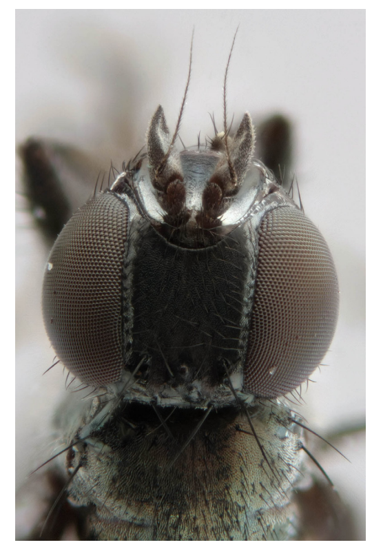
Head and thorax - dorsal view