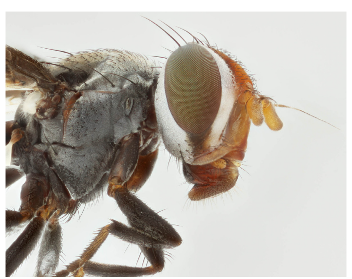
Head and thorax - lateral view