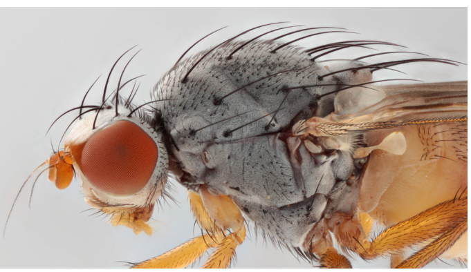
Head and thorax - lateral view