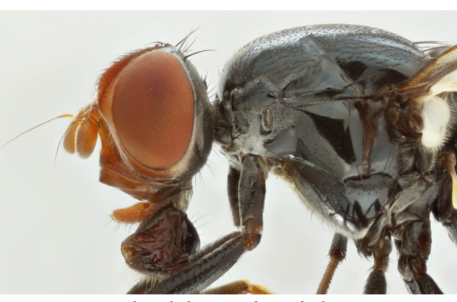
Head and thorax - lateral view